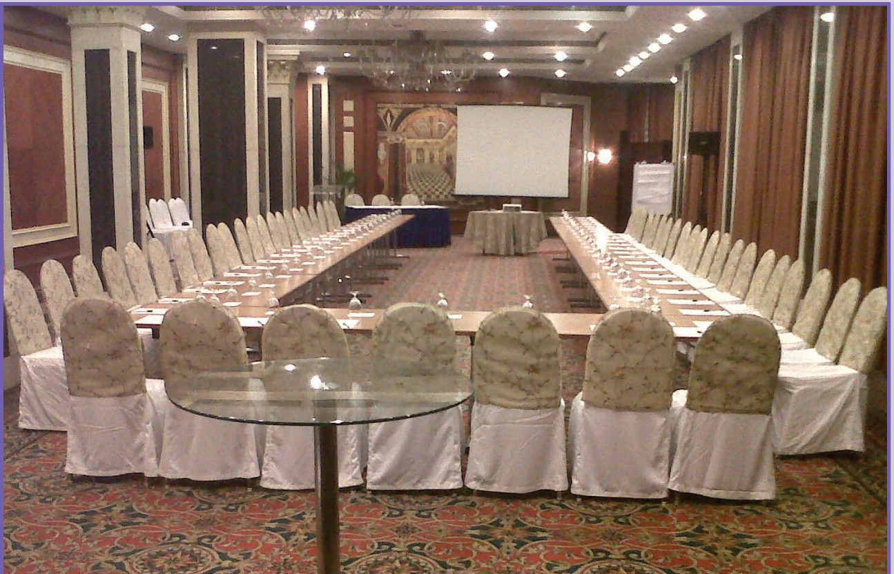
DOMINION U SHAPE